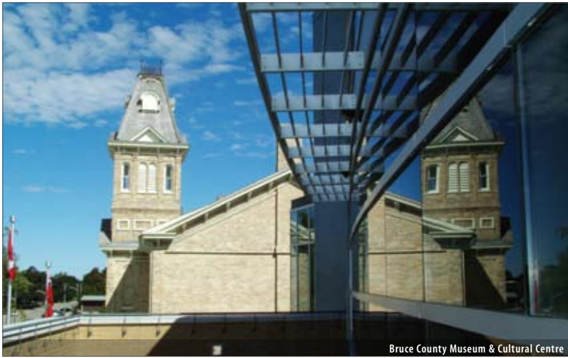
Bruce County Museum & Cultural Centre