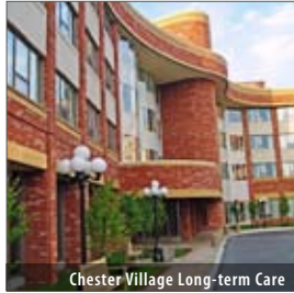
Chester Village Long-term Care