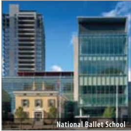
National Ballet School