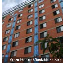
Green Phoenix Affordable Housing

“By using the Loan Program, we have access to financing at a very competitive rate and will have saved hundreds of thousands of dollars over the life of the loan.”