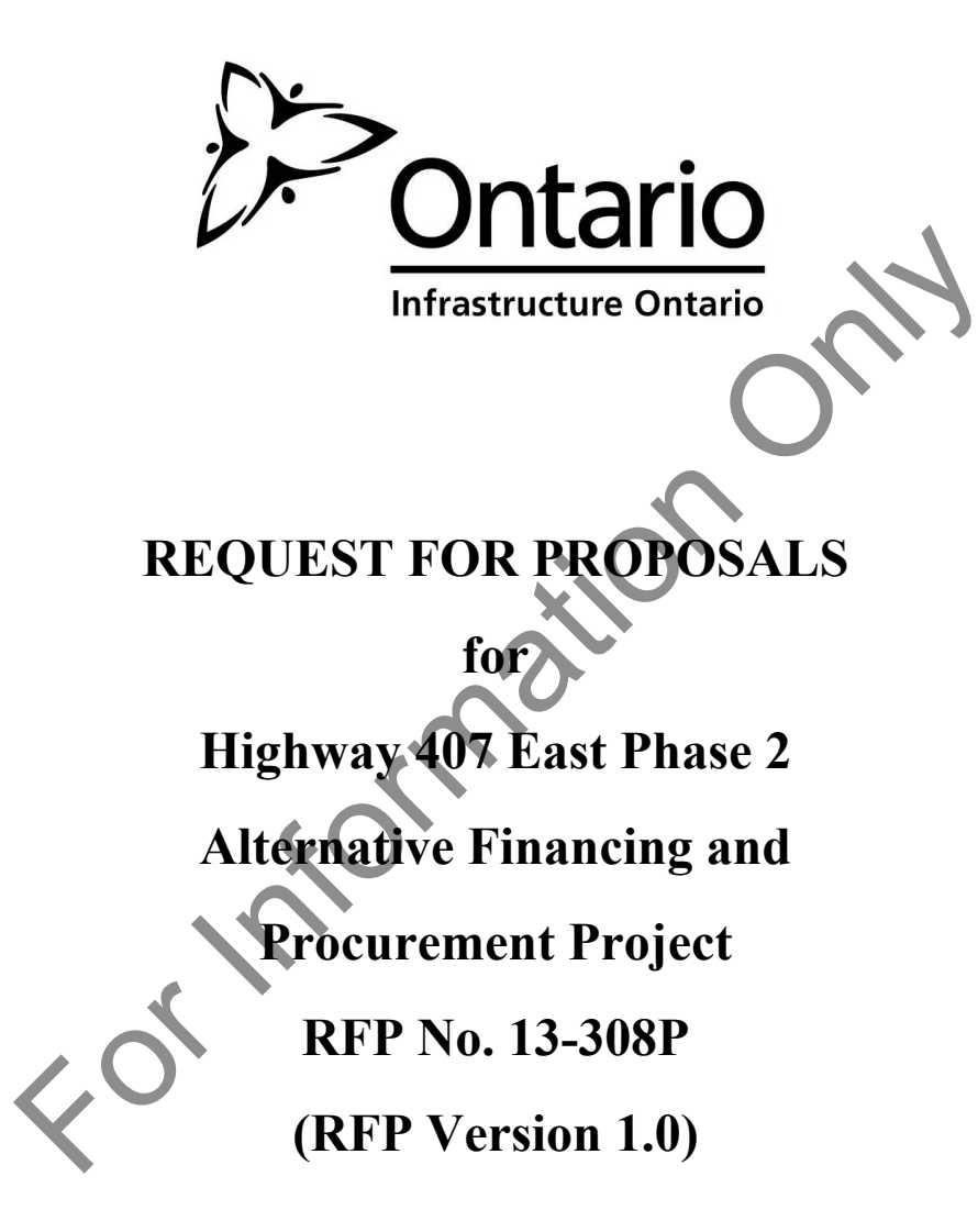
Queen's Printer for Ontario © Copyright 2014 – This document must not be copied or reproduced in any manner without the written permission of Infrastructure Ontario.